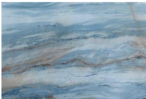
Quarry #2 Blue Quartzite Sample