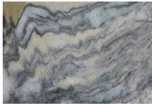
Quarry #5 Layered Quartzite Sample

In 2024, VMC plans to open a fourth quarry (#4) in Bahia State to extract a one-of-a-kind teal colored stone and a further quarry (#5) in Minas Gerais State, some 60 kilometers from the current quarry, to extract a white material shot through with fine layers of blue to black. In both cases, the materials are unique and esthetically desirable. Materials from these additional quarries are expected to fetch high prices. Licensing applications have been initiated and operations are expected to begin in Q2 of 2024.