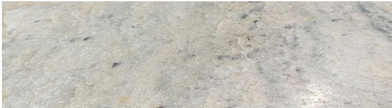
Figure 1 – White Quartzite produced from test block, VMC Quarry # 2