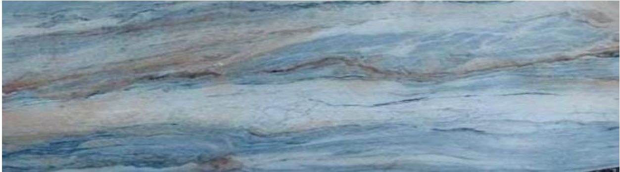
Figure 2 – Blue-Grey Quartzite produced from test block, VMC Quarry # 3

“The blue quartzite produced from the company’s proposed third quarry, has excellent esthetic and physical characteristics. The test block has an attractive mix of blue and white, and the material cuts and polishes easily. These characteristics will appeal to our clients.”