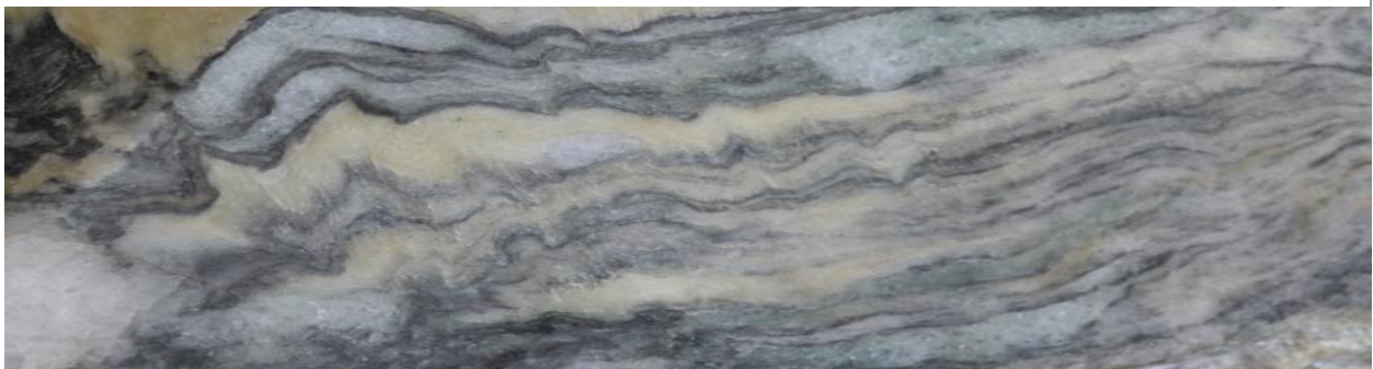
Figure 3 – Grey-White Quartzite produced from test block, VMC Quarry # 4

VMC’s planned fourth and fifth (4 th and 5 th ) quarries are also currently in pursuit of licensing. The materials for these proposed quarries have never been brought to market and will likely be able to command premium prices which the Company anticipates being in the range $2,500 USD/m 3 .